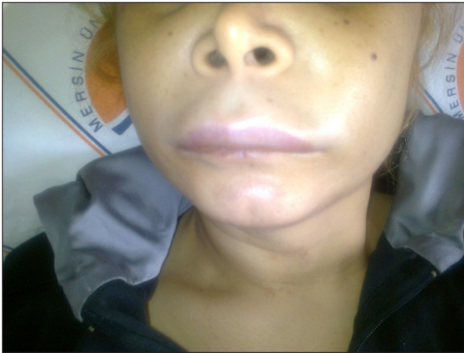
Figure 1: Angioedema of her upper lip and left side of the face.

On admission, blood pressure was 140/90 mmHg, the respiratory rate was 28/min., the pulse rate was 94/min, and the body temperature was 36.5 °C. She had a diffuse, soft, and nontender mild swelling of the left tongue and floor of mouth, and severe swelling on her left face and upper lip (Figure 1, 2).