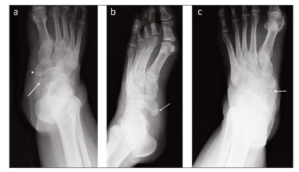
FIGURE 2: Radiographic images of accessory navicular bones a) Anteroposterior radiogram depicting Type I accessory navicular (apparently distinguishable AN) accompanying to a prominent navicular tuberosity on a right foot, b) Type II AN on anteromedial radiogram of left foot c) Type III cAN (attached to main navicular by a stalk) on anteroposterior radiogram on a left foot. Figure legends: Black arrow: accessory navicular bone; white arrowhead: prominent navicular tuberosity.