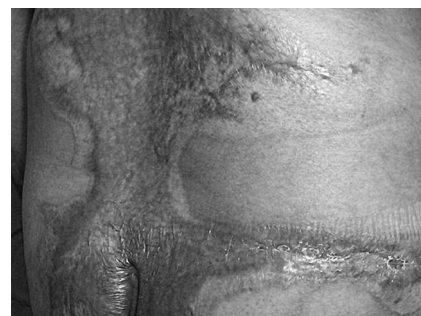
Fig. 2e - Late view of wound. Note some scar hypertrophy.

for closing skin wounds, taking it from unusual donor sites.