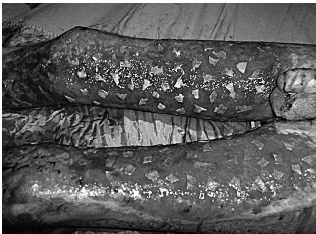
Fig. 1a - Intra-operative view of burn patient with split-thickness island grafts taken from lateral surface of thigh and placed on wound surface.