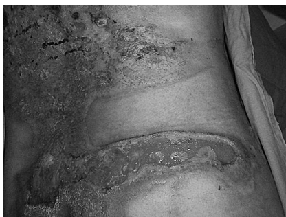
Fig. 2d - Island grafts and donor site on day 6 after operation.

Orgill 5 emphasized that the island graft was a simple method for demonstrating the effect of epithelial derivatives on wound regeneration, without using sophisticated biological or genetic markers, and that it permitted observation of test material within the wound without interference from the periphery until wound contracture and epithelialization of the surrounding skin encroached upon the study area. This was an interesting approach to the island graft used for experimental purposes - our study, unlike that of Orgill, included a clinical experience of the island graft