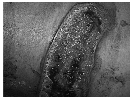
Fig. 2c - Island grafts on wound.

patients contractures developed after wound healing and surgical intervention was needed. Pressure garments were used in all patients to prevent hypertrophic scar formation.