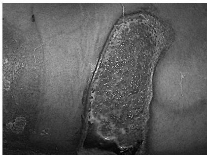
Fig. 2a - Skin defect in lumbar area due to burn injury.