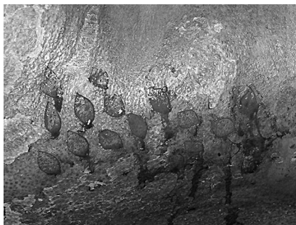
Fig. 2b - Same patient, elliptically-shaped island graft taken from superficially burned and healed area.