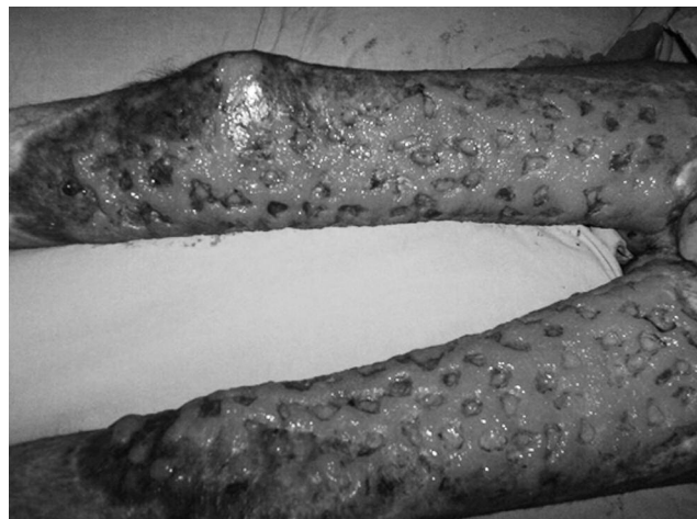
Fig. 1b - Epithelialization spreading on wound surface. Note that most of the island grafts were taken from their sites for transfer to the posterior surface of the lower extremity.