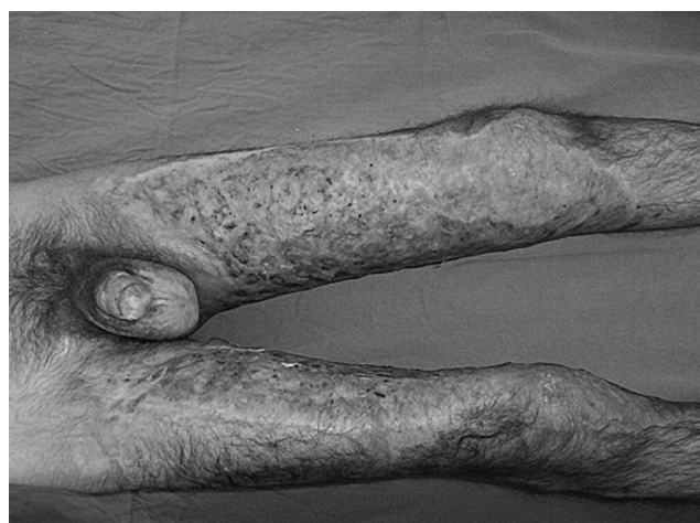
Fig. 1d - Late results of lower extremity defect closed by the epithelialization generated by island grafts.