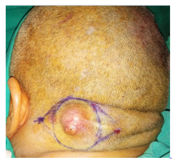
Figure 1 Clinical appearance of the tumor was shown

Sixty-two years old female patient admitted to our Otorhinolaryngology department for a recurrent scalp lesion. She had a history of SCC in the same region treated with wide local excision 9 months ago. She had no chronic sunlight or occupational chemical exposure history. On her physical examination there was a 3x3 cm. nodular exophytic fungating mass on left side of the occipital region of the scalp (Figure 1).