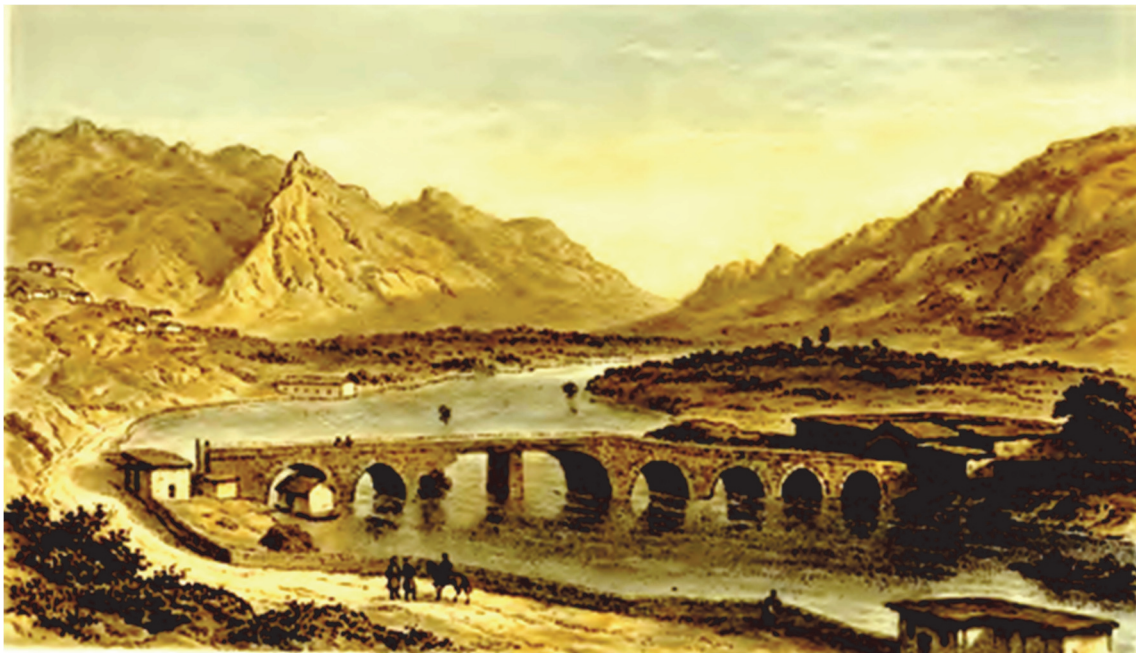
Fig. 5) The Engraving drawn by Bartlett in 1836 (Yurtsever 2018, 43)

The fifth span in the center of the Misis bridge exhibits a different form than the rest of the arches. This span has a form between that of a circular and a pointed arch. It is known that this form, called parabolic arch, was used in Ottoman architecture 34 . At this point, the writings of Langlois and an engraving by the English painter Bartlett explain why the aforementioned span has a different design from the others. Langlois states that Ibrahim Pasha of Egypt blew up an arch of the bridge while retreating. Also in these writings, it is told that the exploded arch was not repaired for a long time and that temporary solutions were devised to cross over the bridge 35 . The engraving drawn by Bartlett in 1836 provides an answer to the question of what the temporary solution was. In the said engraving, it is seen that the section where the fifth arch was located is covered by a wooden setup (Fig. 5).