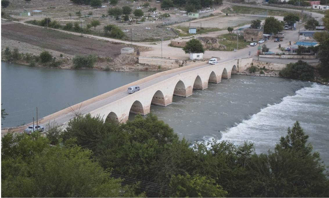
Fig. 1) The Downstream of the Misis Bridge

The Misis bridge, which provides a road connection over Pyramus, extends along the northwest-southeast axis and consists of a total of nine spans. The length of the deck of the bridge is measured as 129.51 m and the width as 6.50 m (Fig. 1). Damaged by the earthquake in 1998, the structure was restored subsequently.