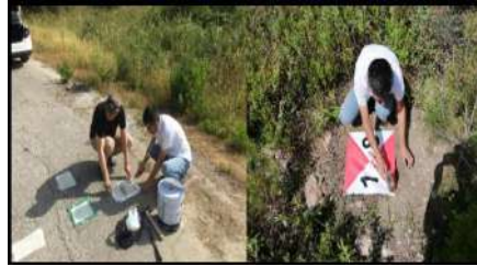
Figure 1. Ground Control Point Facilities view

In addition to the polygon stones, 51 YCP points were established in the study area, 23 of them were used in Balancing and 51 of them were used as check notes in orthophoto accuracy analysis. The desired land topography is an undulating land structure so that the soil movements (excavation and fill amounts) on the highway project routes can balance each other. For this reason, this section of Mersin Fındıkpınarı Provincial Road, which has a wavy land structure, was preferred in order to make a more accurate comparison in the soil movement evaluation (excavation-fill) of the DTM (Digital Terrain Model) to be obtained in this study as the study area. Before the field studies, the UAV (Revolving Wing) to be used in the application, digital camera (integrated with the UAV), GNSS device, and (cloth tarpaulin and line paint) to be established as ground control points in the evaluation of the photographs obtained by the UAV were provided (Figure 1).