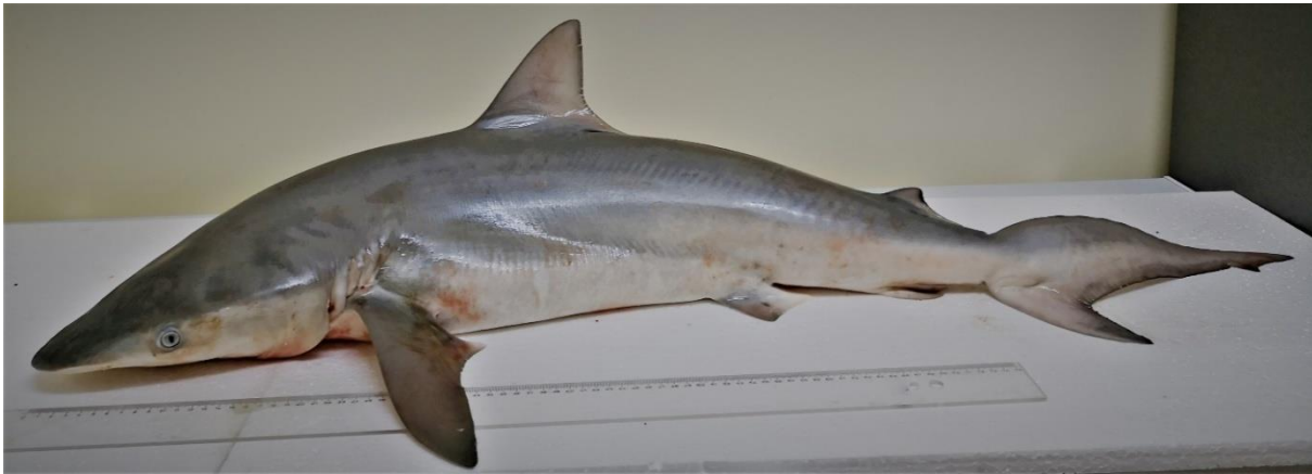
Figure 2. The juvenile specimen of the C. brevipinna