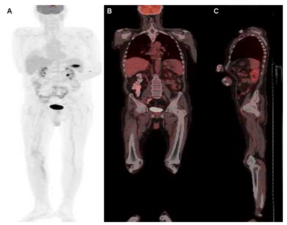
Figure 3. Complete improvement of the findings after chemotherapy in MIP (A), coronal fusion (B) and sagittal fusion (C) PET-CT images. Primary skeletal lymphoma is rare. It occurs in 0.5% of all extranidal lymphomas. Muscle involvement of the lymphoma is rare but most commonly seen in the diffuse B-cell lymphoma subtype as seen in this case. Most moderate to high grade have aggressive histology [1]. A systematic study of 82 autopsy cases showed that contrary to common assumption and scant literature reports, skeletal muscle involvement in leukemia-lymphoma is not a rare phenomenon [2]. HTLV-I infected synovial cells in conjunction with leukemic-lymphomatous infiltration of synovial tissue is reported in a case by Dennis G et al [3]. There are some similar case reports in the literature with muscle involvement [4-7]. Muscular disorders mimicing NHL involving skeletal muscles are primary soft tissue sarcoma, muscle sarcoidosis, intramuscular metastases, myositis, inflammatory pseudo-tumors, and skeletal muscle lymphoma. Extremity muscles; especially the lower extremity muscles are the most frequently affected areas, as in this case. Systemic lymphoma spreads to the skeletal muscles by hematogenous and lymphatic pathways. In this case report, PET-CT imaging findings were presented at the time of leukemic-lymphomatous infiltration in rare muscle structures.

Radiol Diagn Imaging, 2017 doi: 10.15761/RDI.1000115 Volume 1(3): 2-3