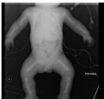
Figure 3. Straight femurs in radiogram of the skeletal system

In this article, we present a case of type 2 TD with a T394k mutation, a finding in the FGFR3 gene which has not been reported previously.