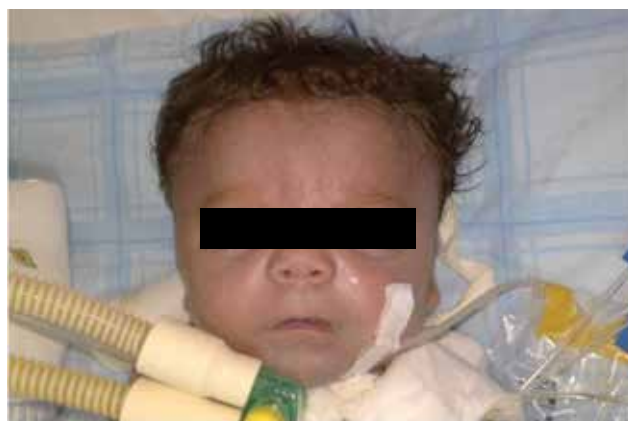
Figure 1. Clover-leaf skull anomaly, flat facial appearance, protrusion of the forehead, protruding prominent eyes, hypertelorism, saddle nose, wide nasal ridge

In the genetic investigation, exons 9, 10, 13 and 15 were scanned. A heterozygous T394K mutation (changing from ACG to AAG) was detected in the exon 10 (Figure 4). The family was informed about the result of the genetic examination and their consent was taken to publish this case including the infant's pictures.