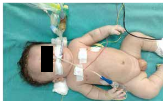
Figure 2. Short limbs particularly in the proximal portions, short fingers, skin folds on limbs, short neck