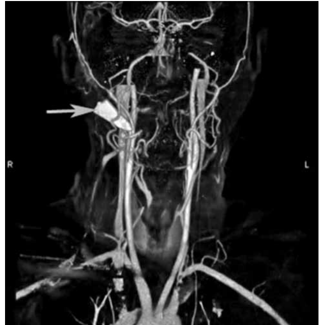
Figure 2. Magnetic resonance angiogram, anteroposterior view depicting the foreign body lodged close to the right left sided carotid bifurcation (arrow points to the foreign body).

and zone III is located between angle of mandible and skull base. These zones have different vulnerabilities to trauma. Although the trauma related with zone I and III is more fatal than zone II, zone II is generally accepted as the most vulnerable zone of the neck to trauma because of its weak bone protection. [1] Additionally, vascular injuries are more frequent for the trauma of zone II than zone I and zone III. Our patient’s wounds were located in zone II. For penetrating injuries of zone II it is generally accepted that physical examination and angiography have the same sensitivity for detecting possible vascular injuries. [6] Additionally because of the invasiveness of angiography and risk of allergic reactions, we decided to perform MRA instead to