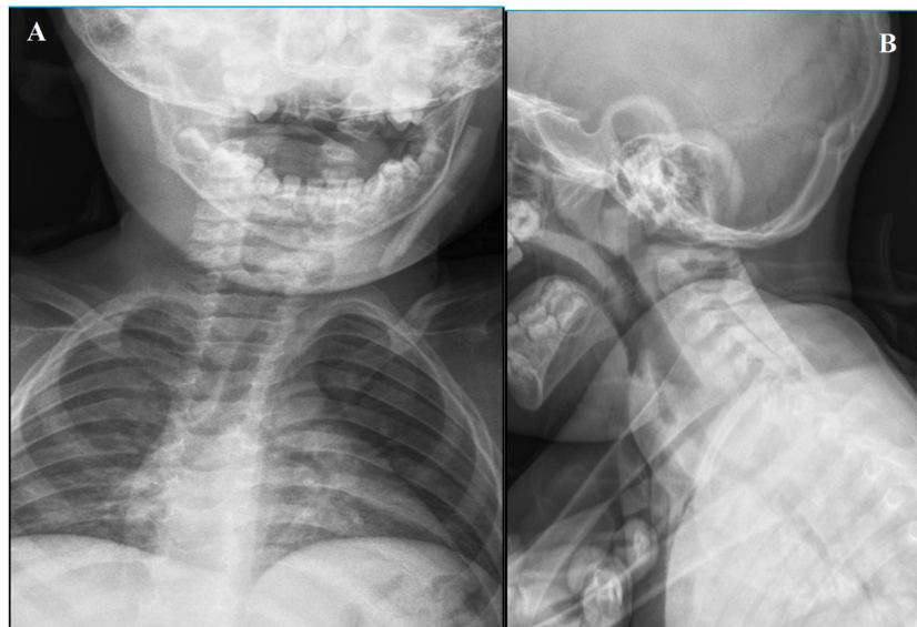
Figure 3 (A) Scope image taken intraoperatively anteroposterior view; (B) scope image taken intraoperatively lateral view.

no another foreign bodies with intraoperative fluoroscopy, and suture/closure of the wound was applied (Fig. 3A and B). When the patient's family was questioned later, it was learned that a glass cabinet had fallen on him 4 months